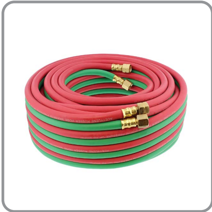
OXYGEN & ACETYLENE HOSES