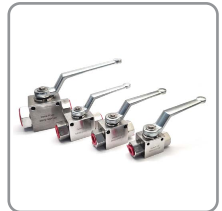
HIGH PRESSURE HYDRAULIC VALVES