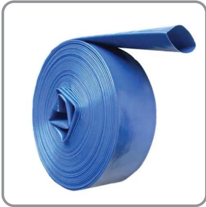
LAY FLAT HOSES