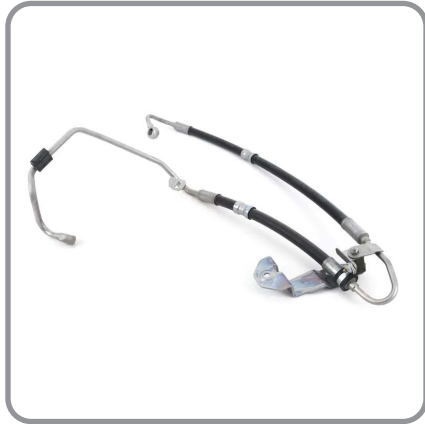
POWER STEERING HOSE REPAIRING