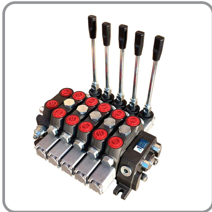
HYDRAULIC CONTROL VALVES