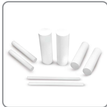
TEFLON & NYLON RODS