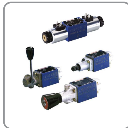
HYDRAULIC SOLENOID VALVES