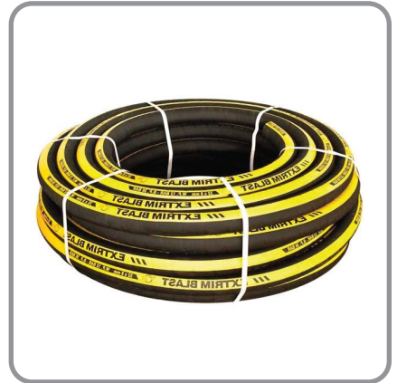
OIL SECTION & WATER SECTION HOSES