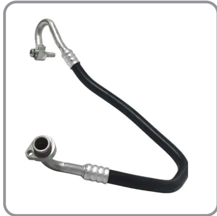
A/C HOSES REPAIRING & FABRICATION