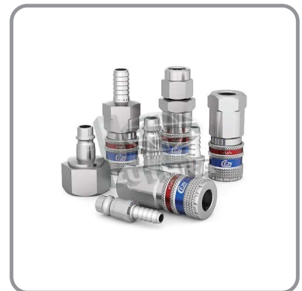
PNEUMATIC QUICK CONNECTOR