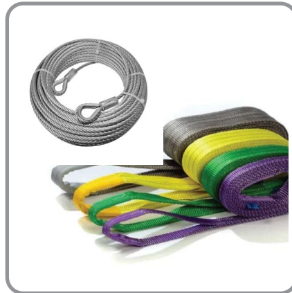
WIRE ROPES & LIFTING BELTS