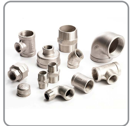
SS AND GI FITTINGS