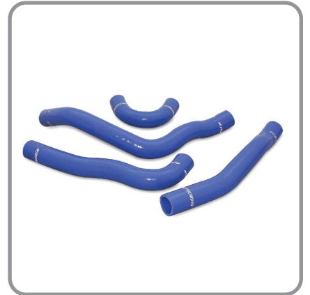
SILICONE BELOW HOSES