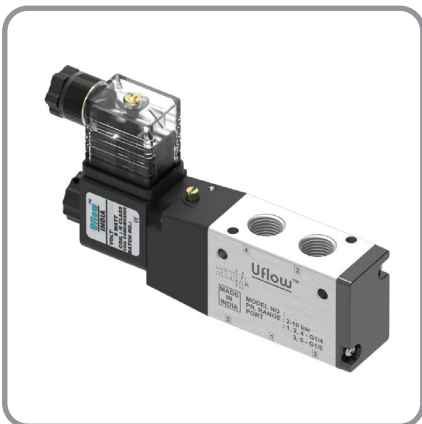
PNEUMATIC SOLENOID VALVES