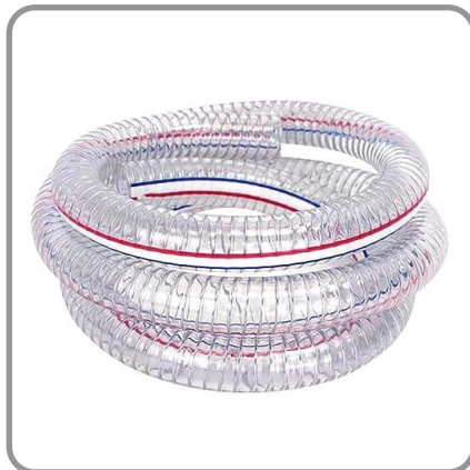
STEEL BRIDED HOSES