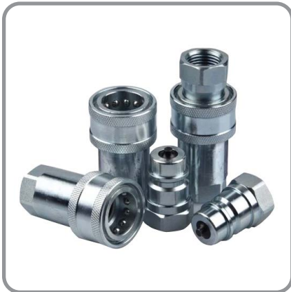
HYDRAULIC QUICK COUPLINGS